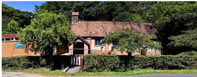
Church of St John the Baptist

Market Place Ringwood Hampshire BH24 1AW