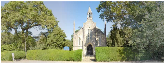
Church of St Paul

Linford Road Ringwood Hampshire BH24 1TY