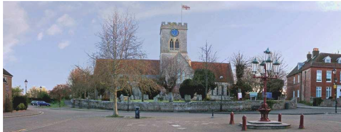
The Church of St Peter and St Paul

Market Place Ringwood Hampshire BH24 1AW